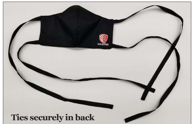
Ties securely in back

Designed without uncomfortable elastic behind the ears to avoid instances of skin irritation or cutting when worn for long periods of time.